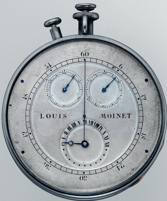
The world's first chronograph Louis Moinet, 1816

Louis Moinet originally designed his novel instrument to carry out celestial observations, which required precise calculations of the speed at which the stars moved. This «thirds counter» ( Compteur de tierces ) was the first of its kind and a testament to the genius of its creator. Moreover, it was the first chronograph ever built. Louis Moinet's brilliant creation incorporated numerous innovations, some of which would not be repeated until a century later.