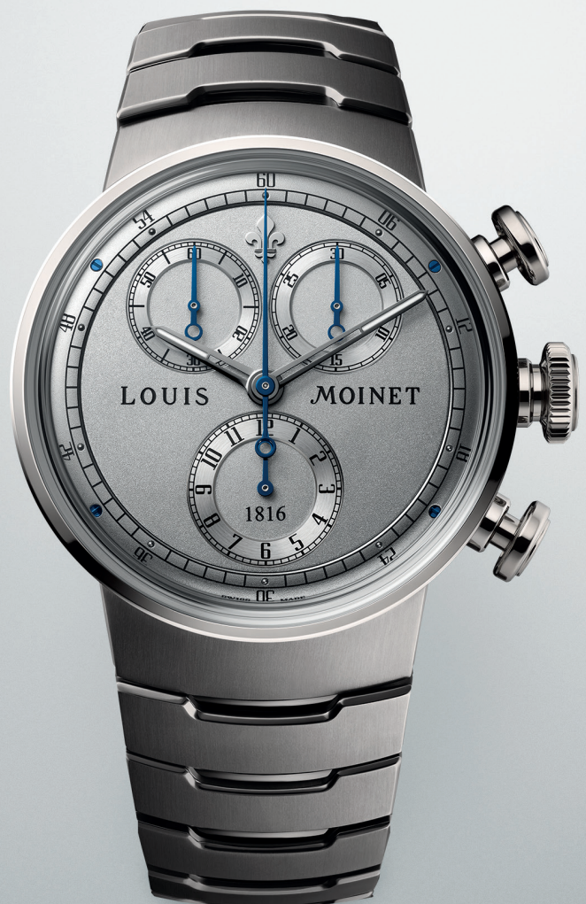
1816 An icon reborn